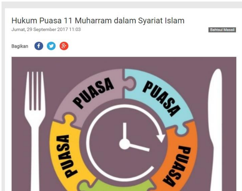
Figure 3. Targeted keywords about hukum puasa 11 Muharram dalam Syariat Islam