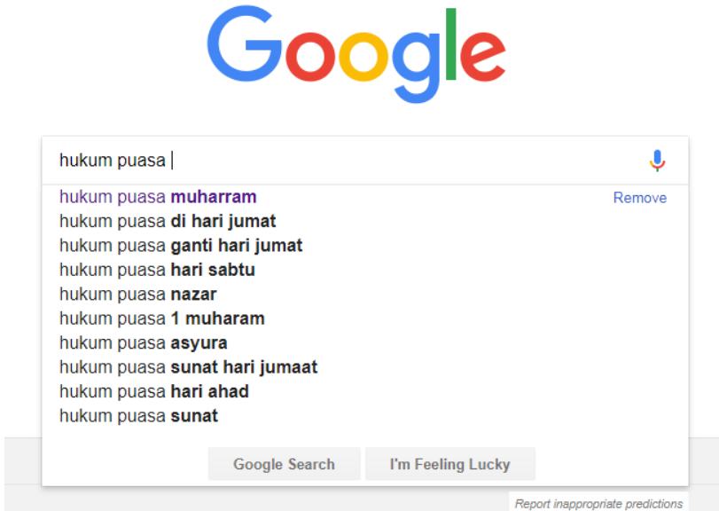
Figure 1. The view of Google suggest

The important thing is, make sure the keywords is not a keyword that includes false news, which is known as a hoax. Allah SWT said: