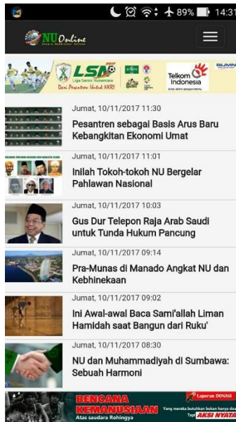
Figure 2. Example of mobile view nu.or.id

It's essential to create a website. But more important to make sure your website mobile friendly and performs well on mobile devices. Over 60% of daily searches are now completed on a mobile device. 23 Today, we need to use Google Accelerated Mobile Pages (AMP) too for the maximum result on search engine results page (SERP).