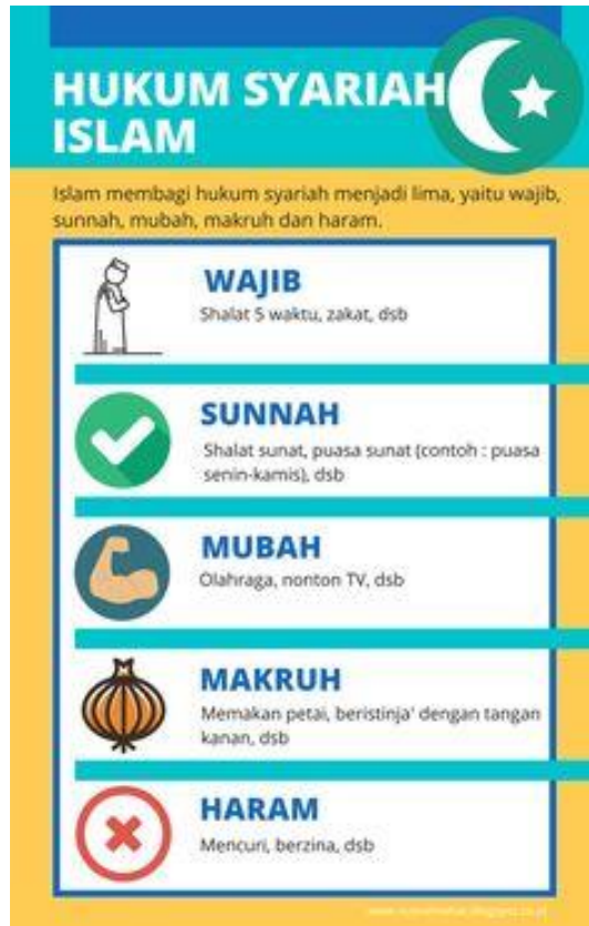
Figure 4. Infographic about Islamic Sharia law